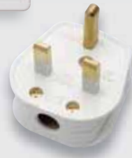
PA380WH Non-standard plug