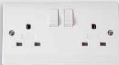
CMA936 Non-standard socket