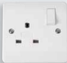
CMA935 Non-standard socket